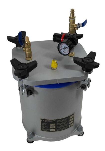
TRANSLATION OF THE ORIGINAL USER MANUAL